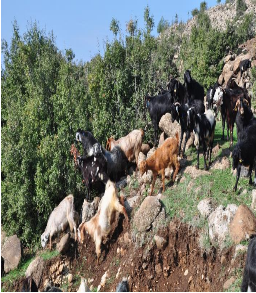
Figure 2: Goats grazing maquis-type plants