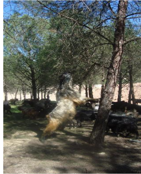
Figure 3: Goat eating lower tree branches

According to data from the General Directorate of Forestry, a forest area the size of approximately 13,000 football fields (11,456 hectares) burned in Türkiye in 2013 (Anonymous, 2015b). Around 99% of forest fires in Türkiye are caused by carelessness, negligence, or deliberate action, while only 1% are caused by lightning strikes (Anonymous, 2015c). Most forest fires start as surface fires, then spread to lower branches. In forests dominated by mature trees, fire begins as a surface fire: first, dry plant residues, grasses, and seedlings ignite quickly; humus layers and roots ignite more slowly. This is called a surface fire. As it proceeds, they spread to shrubs and saplings, becoming harder-to-extinguish fires. Allowing goats to graze surface vegetation significantly aids in preventing this type of fire (Keskin et al., 2015).