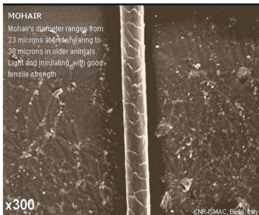
Figure 1. Microscopic view of mohair fiber (Dellal 2021).

Mohair (Figure 1) is the name given to all the fibers that are produced by the primary and secondary follicles in the skin of the Angora goat and form the total fiber coat. Mohair is most commonly known in the world as "mohair" and is formed by combining the Arabic word "muhayyer", meaning distinguished, with the English word "hair", meaning fiber. The most important yield of the Ankara goat is mohair and it is the only goat breed in the world that produces mohair fiber. Therefore, the Angora goat is a fiber animal (Dellal 2021).