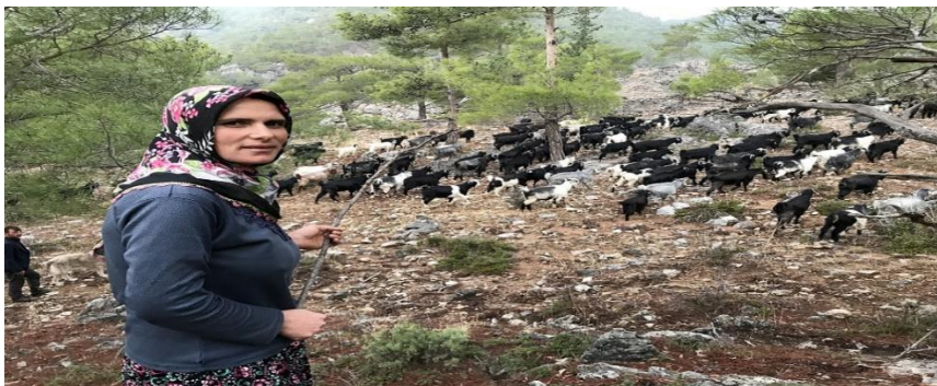
Figure 1: A nomadic girl grazing goats in the forest

A flock of goats can feed themselves by walking 15-20 km a day (Özcan, 1989). Because each herd is led by at least one shepherd, shepherds roam the forests throughout the day. Shepherds and the nomadic families who stay in forest areas during the summer months are the ones who can detect any potential problems, including fires, early and report them to the relevant authorities (Figure 1).